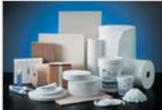
Refractory Fibers and Clay Products in all temperature ranges