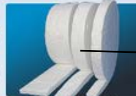
Ceramic Fiber Shapes