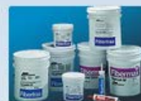
Ceramic Fiber Liquids