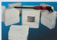
Ceramic Fiber Modules