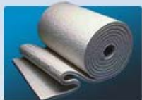
Ceramic Fiber Blankets

Ceramic Fiber Insulation, Modules, Gaskets & Fireproof Insulation