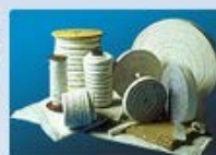
Ceramic Fiber Textiles