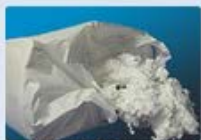
Ceramic Fiber Bulk Fibers