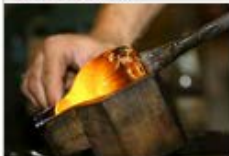
Glass Blower and Pottery Supplies

Talk with one of our experts about your project needs