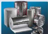
Fireproof Duct Insulation