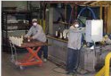
Custom Vacuum Formed Shapes and Field Refractory Installations