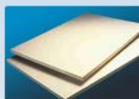
Ceramic Fiber Board