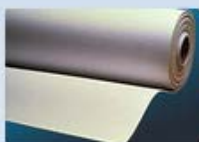
Ceramic Fiber Papers