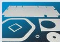
Ceramic Fiber Gaskets